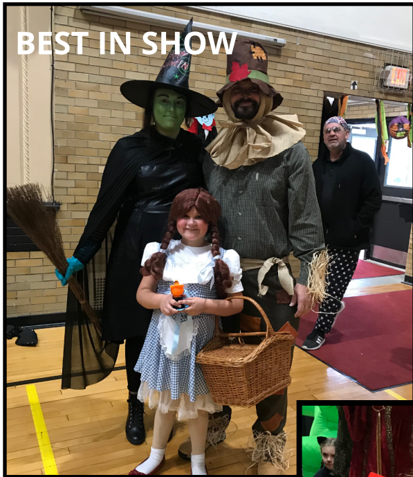
BEST IN SHOW