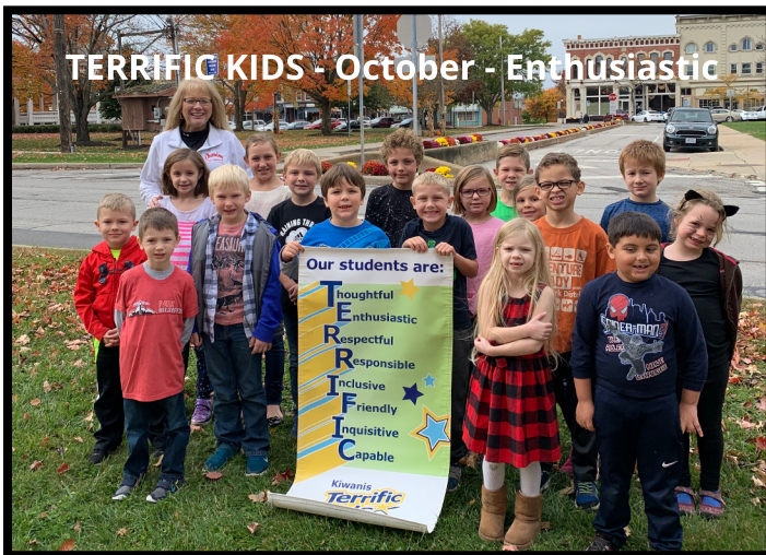
TERRIFIC KIDS - October - Enthusiastic

Please fill out the form that was sent home this week or call the school if you are interested in participating.